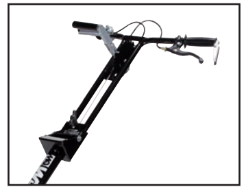
Also available with QPHAFC Folding QuickPitch™ handle

Power trowels for use in confined or enclosed areas.