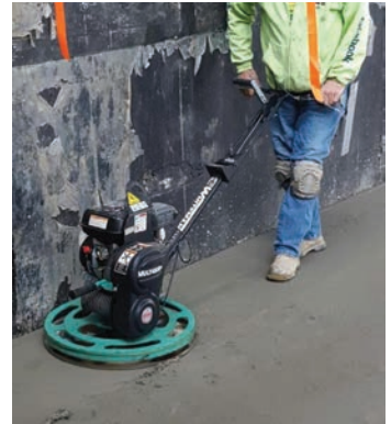
Image shows rotating guard ring feature in use.