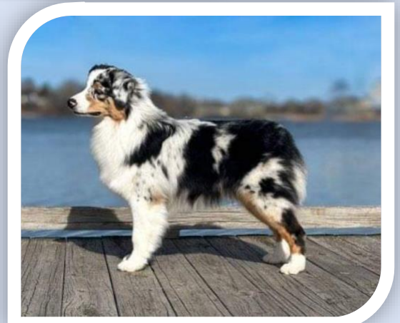
Applestream's Reliving Flashdance ITD CGC (AKC mjr ptd) "Cara"