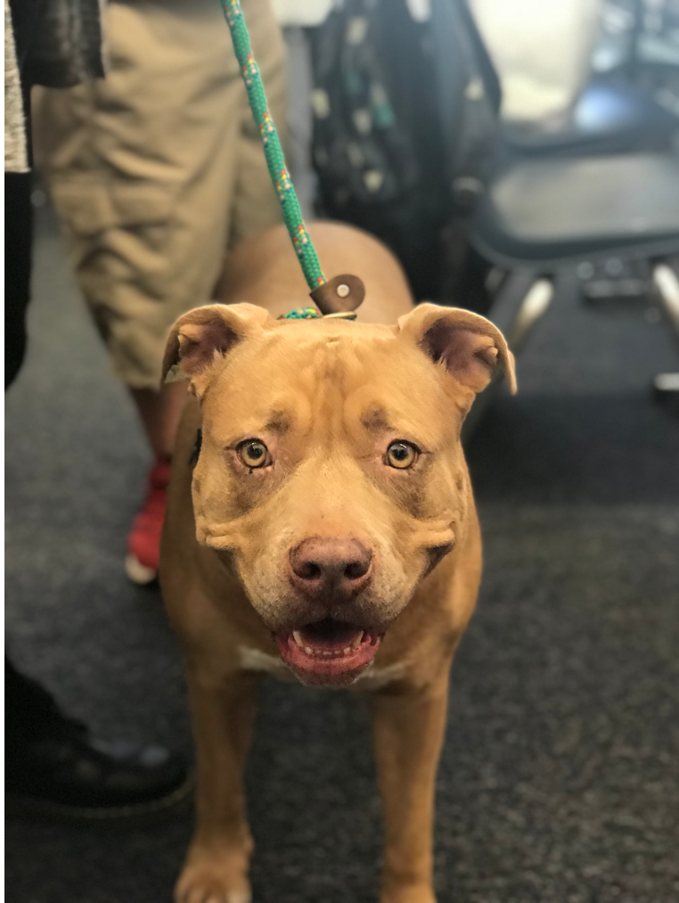
CAUGHT BEING KIND ACTS OF FRIENDSHIP/ALLYSHIP