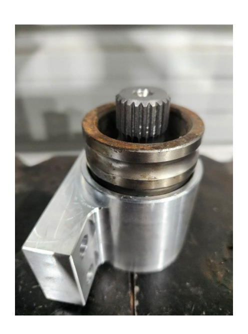
INSTALL C CLIP TO ASSEMBLY