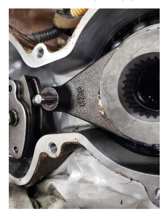
Change the axle seal now if desired Apply silicone to the cover before install

Cycle the shift plate to ensure the gear engages with the carrier