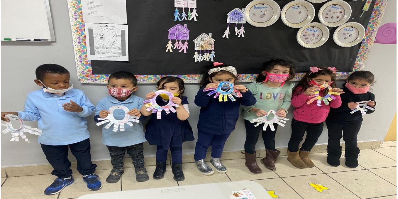
(Language Art Activity: making Octopus with letter O!)