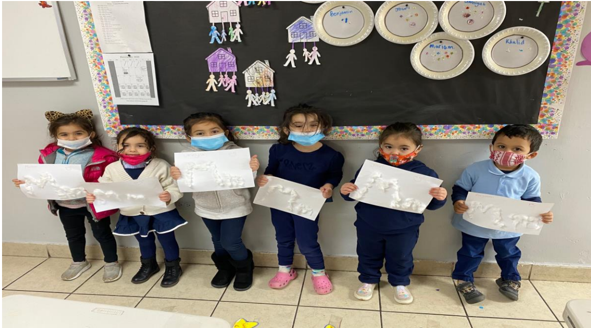
(Language Art Activity: making letter Mm with cotton!)