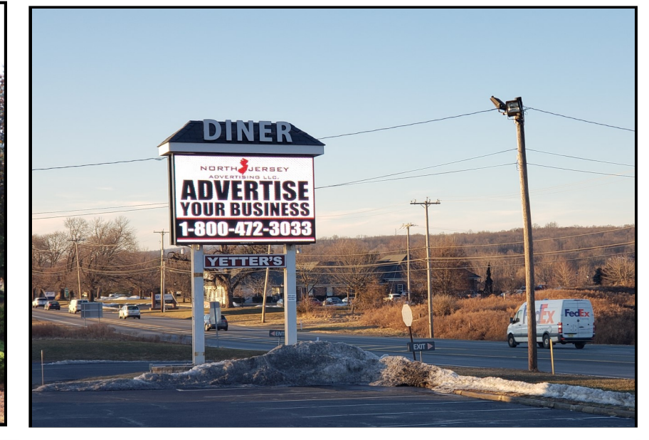
RT 15 NORTH (LAKE HOPATCONG)