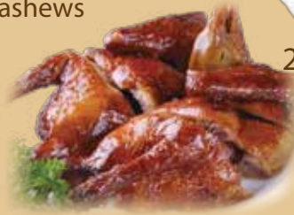
時價 Seasonal price