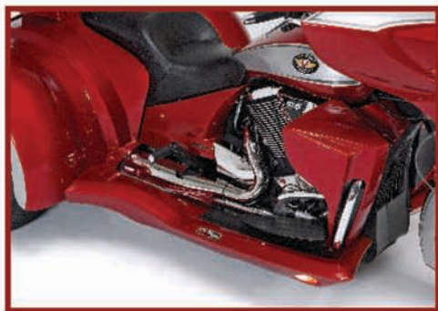
Optional Ground Effects

Introducing the all new Ventura for the Victory Touring class motorcycles. The VENTURA has captured Victory's classic edgy style and incorporated its distinctive lines and feel into a truly complementary custom look that begs to be ridden. The VENTURA challenges all other touring trikes with our industry leading independent suspension, a 6.2 cu. ft. trunk that almost doubles our competitors, and styling that is sure to draw a crowd of admirers everywhere it goes.