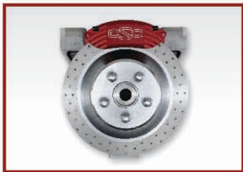
Optional Performance Brake Upgrade