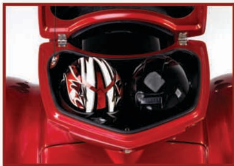
CSC Upper Tour Box - 2.6 cu. ft. capacity