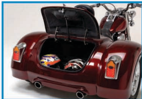
6.5 cu ft of Trunk Storage Capacity

Introducing the upgraded Volusia Trike by California Sidecar. Following the classic lines of the Harley Davidson Softail the CSC body is designed for cruising in style. With it's low center of gravity, stiff chassis and proven CSC Independent Suspension, the Volusia is a great handling and sporty ride, whether cruising or touring.