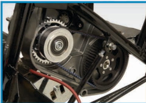
*Electric Belt-Drive Reverse