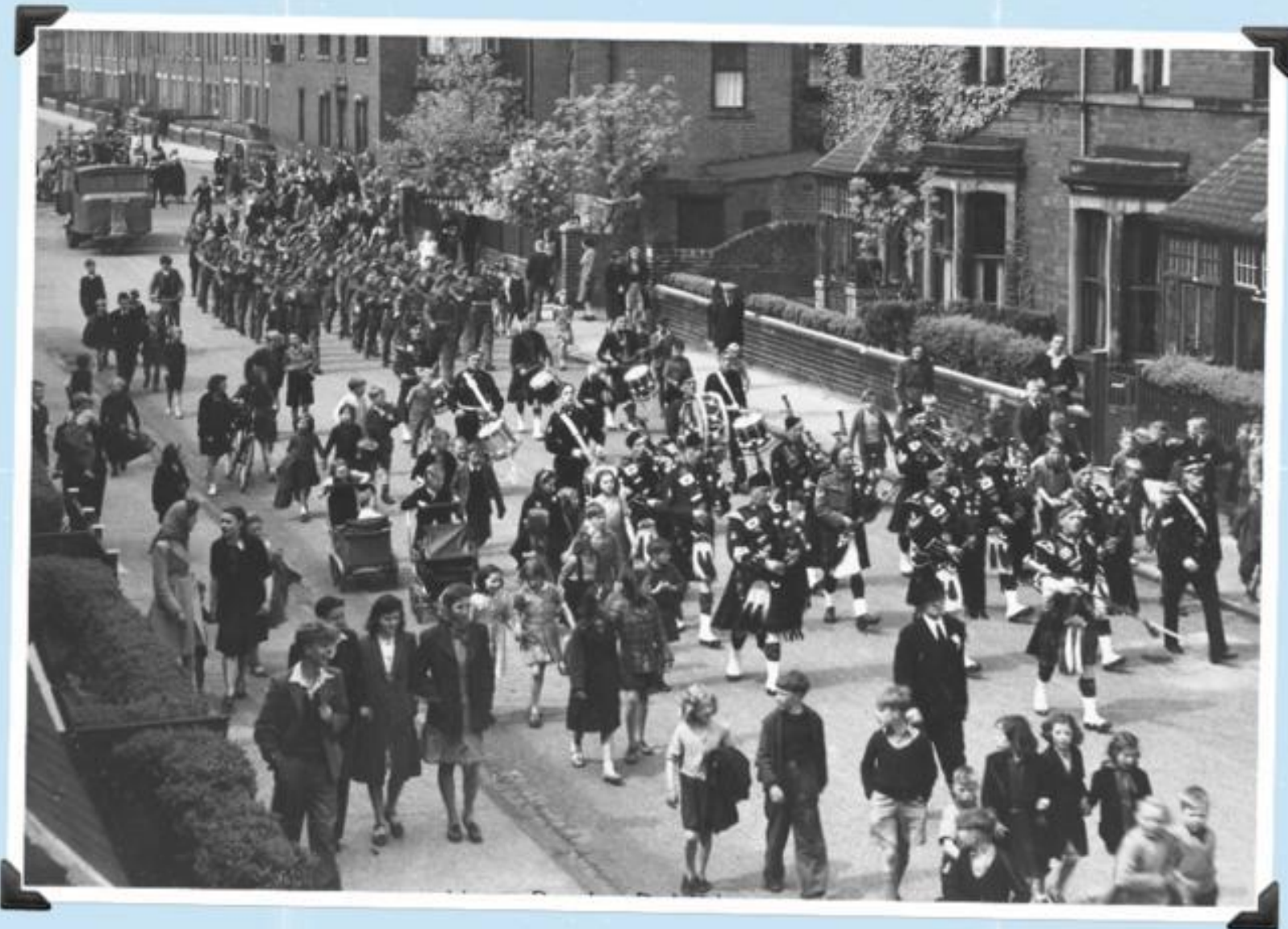
← Crowds gathered to celebrate