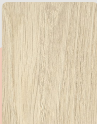
#1955 (OPAL OAK)