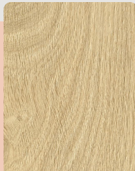
#1956 (PRIMERA OAK)