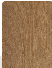
#1954 (HOBART OAK)