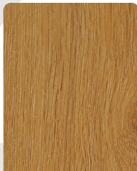
#1953 (FOREST OAK)