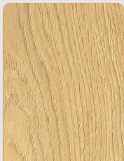
#1952 (SPARTAN OAK)