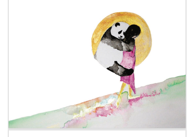
They went everywhere together.

45 La Buena Vista Drive, Wimberley, TX 78676 512-847-6055 | wimberleymontessori.com