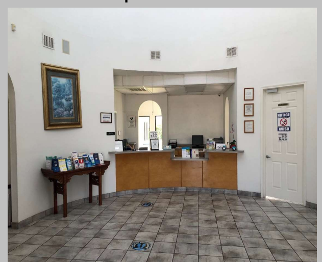
2- Nurse Stations