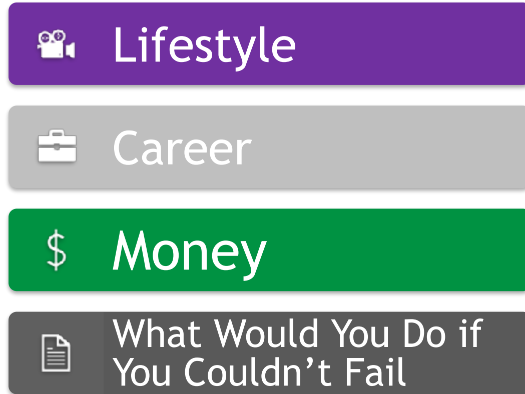
FIGURE Out What You Want