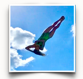
You need 11 solid dives to qualify for States