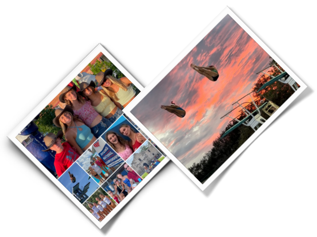
HELPFUL TIPS - We have about a meet a month. Sep thru Aug. Last season we traveled to Coral Springs, Plantation,, Moultrie, Georgia & West Virginia, & Texas.

The following tips are offered to provide you a most positive & cooperative experience: