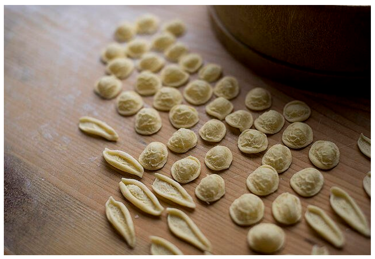
Want local? You will make traditional local pasta shapes with local semolina flour with a local chef in Catania

Today, we will transfer by private bus to Catania, where my Sicilian friend, Chef Loredana, will bring our group inside the vibrant (and delicious) Cantania Food Market -- one of the liveliest open-air daily markets in all of Italy. Together, we'll hunt for the freshest of ingredients for our Sicilian cooking class hosted by Chef Loredana. You'll learn to make fresh cavatelli and many other Southern Italian dishes -- all based on what is freshest that day in the market. The dishes we create will be our delicious Sicilian lunch -- so be prepared to eat molto ! After our class and meal, we'll return to Taormina, where you'll have the evening at leisure to explore the city on your own.