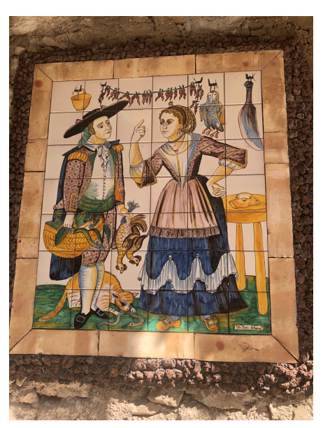
Folk art on tile, Taormina

This tour is perfect for travelers who love to connect with others over great food and wine. You'll make cannoli with Italian nonnas , you'll sip wine in ancient cellars and you'll taste olive oil in the groves where it's grown.