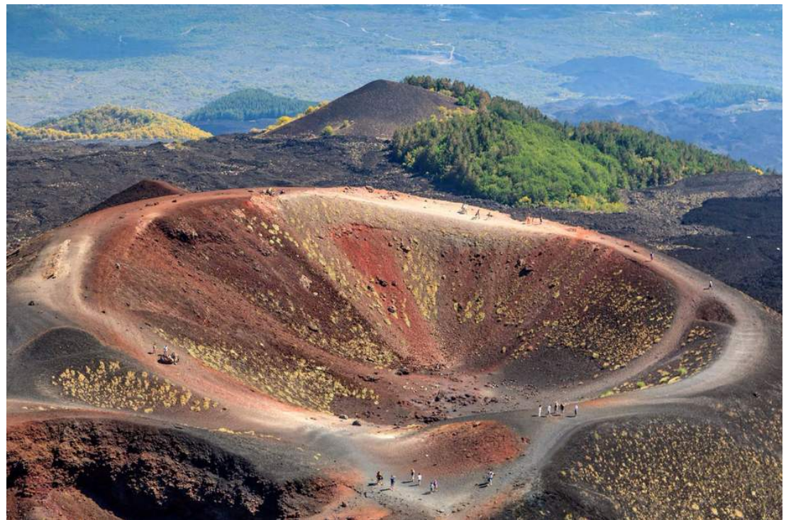
One of Mount Etna's stunning craters.