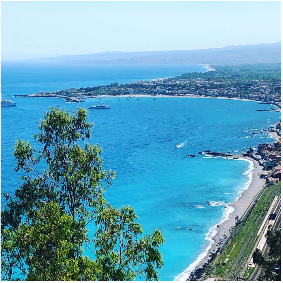
View of Naxos from Hotel Villa Schuler, NO FILTER!