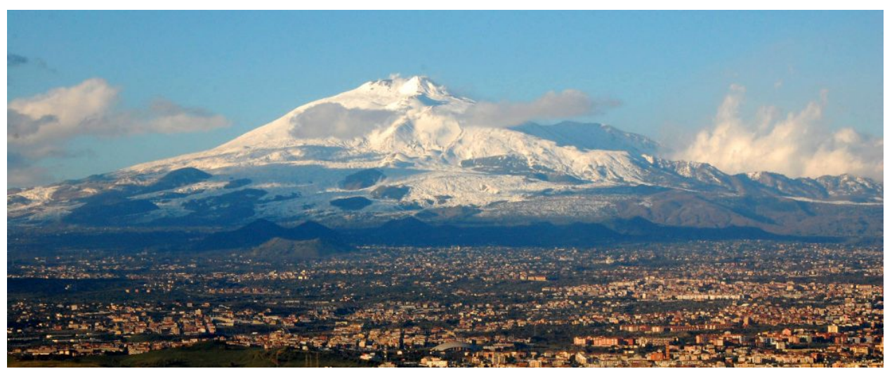
Mama Etna. According to the locals, she is a female because she giveth and she taketh away

Today, after breakfast we will be transported in comfort to the snow dusted summit of Mt Etna, Europes largest active volcano. Once arrived at Etna, we will explore the Mountains craggy craters and ride a cable car to the summit. We will then enjoy an authentic farm house lunch at a local hazelnut farm, savory authentic Sicilian farm to table fare. During our return to Taormina, we will go behind the scenes at a family run wintery on the mineral rich slops of Etna. The Etna volcano produces some of Sicily's most prized varietals including the famous Etna Rosso wines. We will then return to Taormina for a relaxing evening on your own.