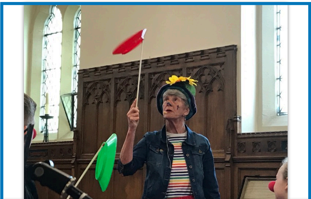
Above. Rainbow the clown shares the Easter message of new hope with children from Great Preston School at St Mary-the-Less, Allerton Bywater and then later in the day with Greenfields School at St Mary's Kippax. Over 1,000 children heard the Easter Message in the week before Christmas.

Vision Planning Consultation St Mary-the-Less Allerton Bywater Sunday 28th April 2.30pm - 4pm This is an opportunity to begin thinking about the churches vision and pray for guidance as to where God is leading us. All are welcome.