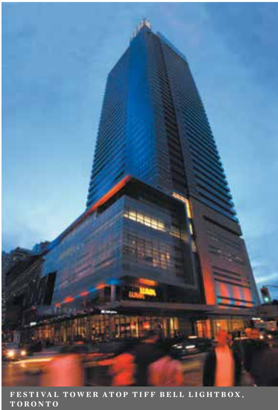
FESTIVAL TOWER ATOP TIFF BELL LIGHTBOX, TORONTO