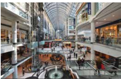
CF TORONTO EATON CENTRE