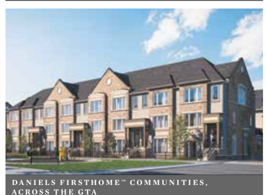
DANIELS FIRSTHOME™ COMMUNITIES, ACROSS THE GTA