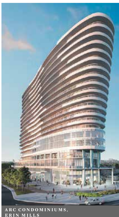
ARC CONDOMINIUMS, ERIN MILLS