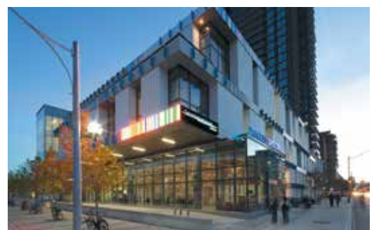
DANIELS SPECTRUM, REGENT PARK