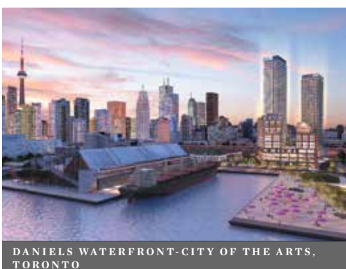
DANIELS WATERFRONT-CITY OF THE ARTS, TORONTO