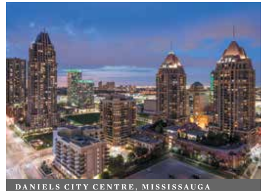
DANIELS CITY CENTRE, MISSISSAUGA