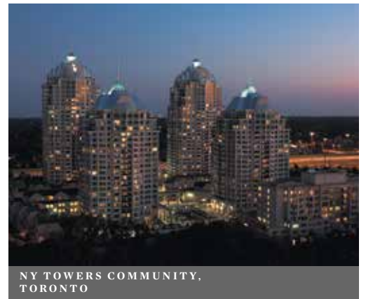
NY TOWERS COMMUNITY, TORONTO