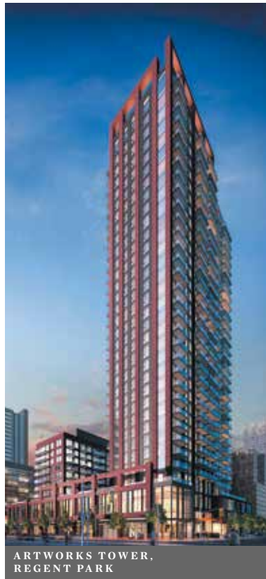
ARTWORKS TOWER, REGENT PARK