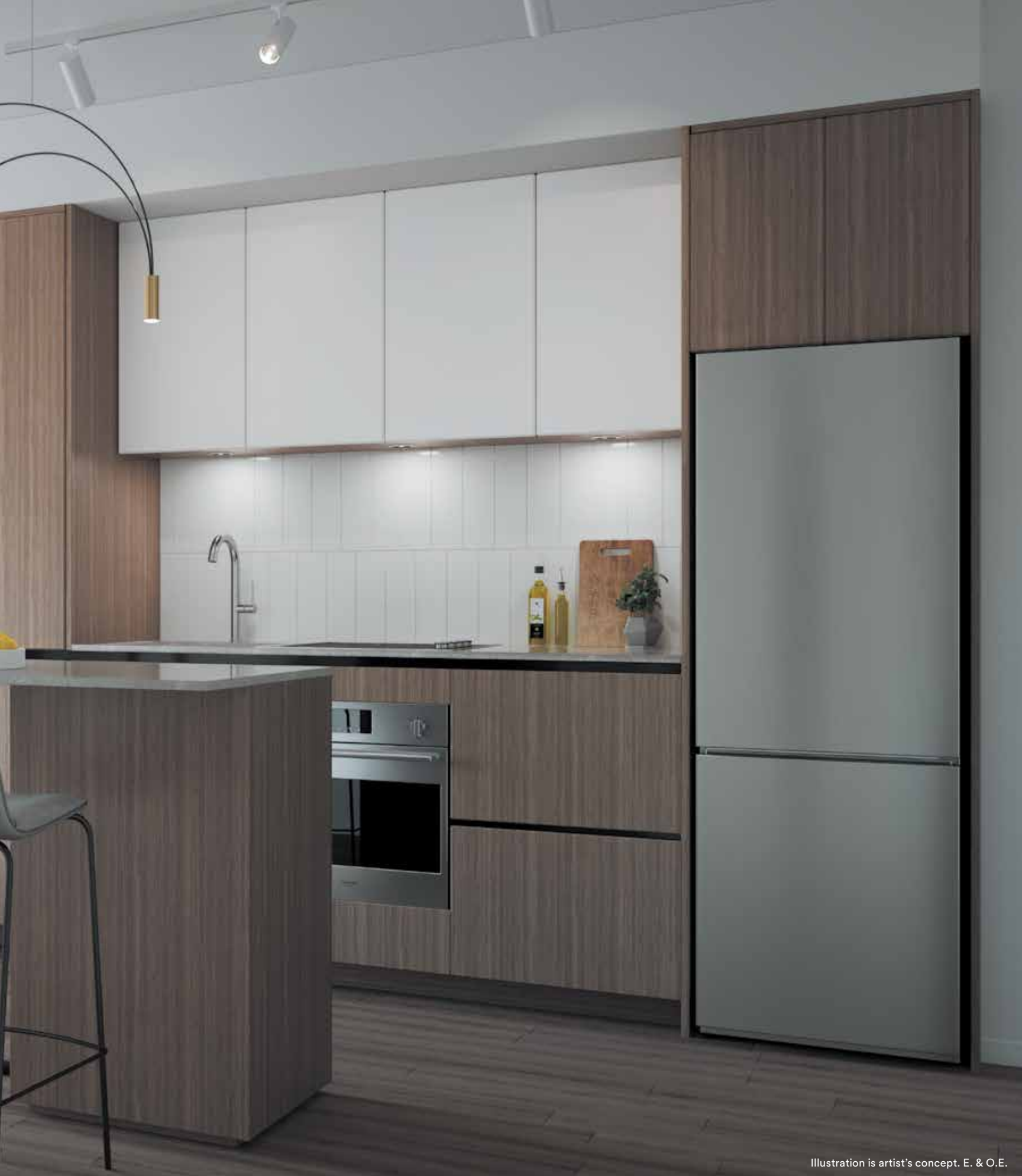
Illustration is artist's concept. E. & O.E.

At The Thornhill, a range of functional and thoughtful designs provide homeowners with a livable space filled with warm, natural light. Quality finishes and contemporary elements honour timeless craftsmanship, allowing you to enjoy the comforts and conveniences of a connected condominium lifestyle.