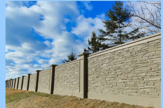
The image provided is intended for reference purposes and may not accurately depict the exact structure or features. Actual specifications, designs, and details may vary, and the image should be considered illustrative

A concrete barrier fencing will also be installed along the Eastern property line to additionally deflect the noise from the railway.