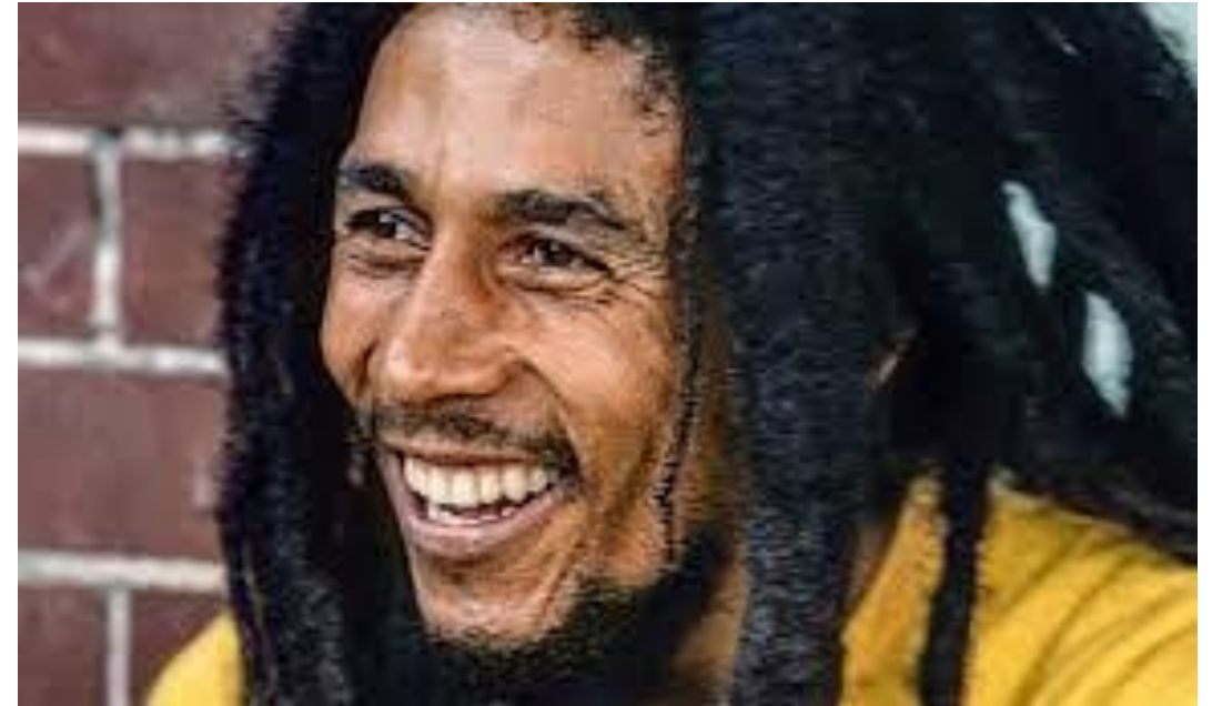
Left: Nadine Sutherland, right: Robert Nesta Marley