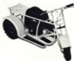
MODEL 502 A 6 h.p. personnel and product carrier - extra zip for heavier hauls.