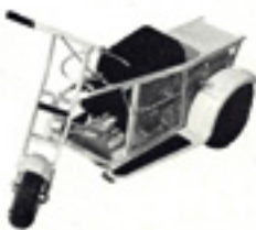
MODEL 504 A 4 h.p. personal and product carrier.