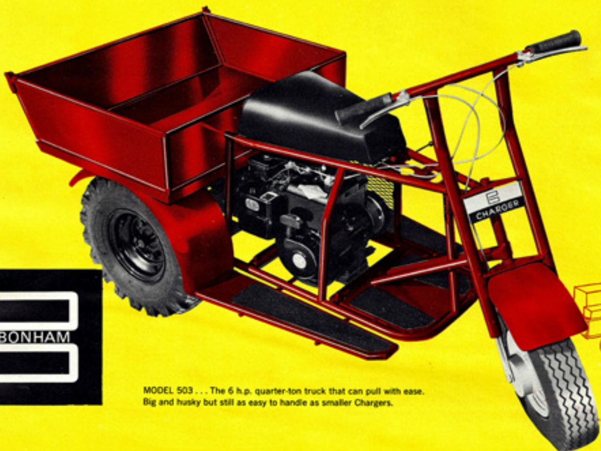
MODEL 503 . . . The 6 h.p. quarter-ton truck that can pull with ease. Big and husky but still as easy to handle as smaller Chargers.