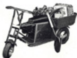
MODEL 505 A 3 h.p. light truck with a load capacity of 350 lbs.