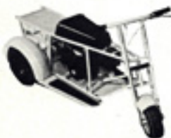
MODEL 501 A 3 h.p. personnel carrier and light tractor.