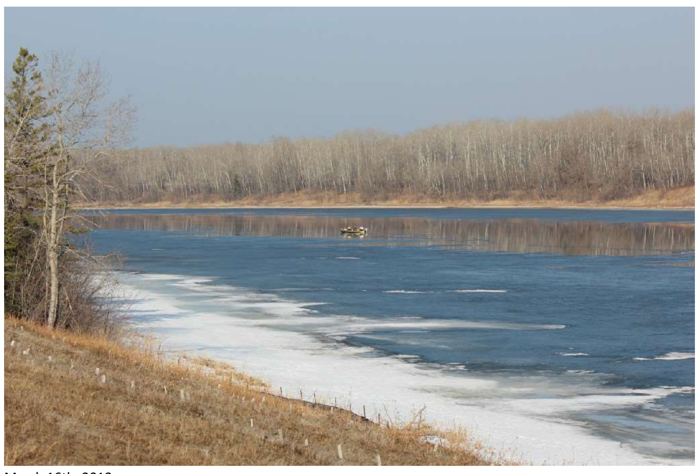
March 16th, 2012:

The Rainy River is now open at the Birchdale landing. There is about 25 yards of shore ice when I was there this morning but by the end of today most of that should be gone. They were getting ready to push boats out when I was there. This picture was taken today at 9:30 am at the Nelson Landing in Birchdale.