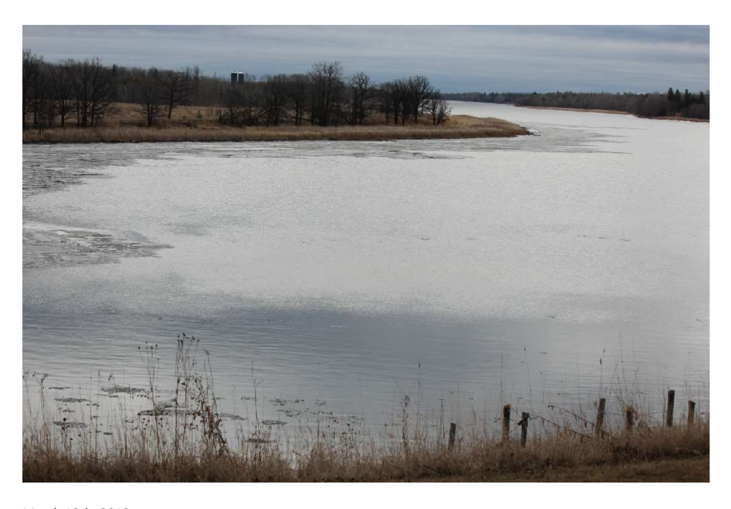
March 19th, 2012:

Froniter is now open as of early this morning. If we have time before dark we plan to go check the access at Clementson and see if it's starting or open there yet. Check back later for updates on that.