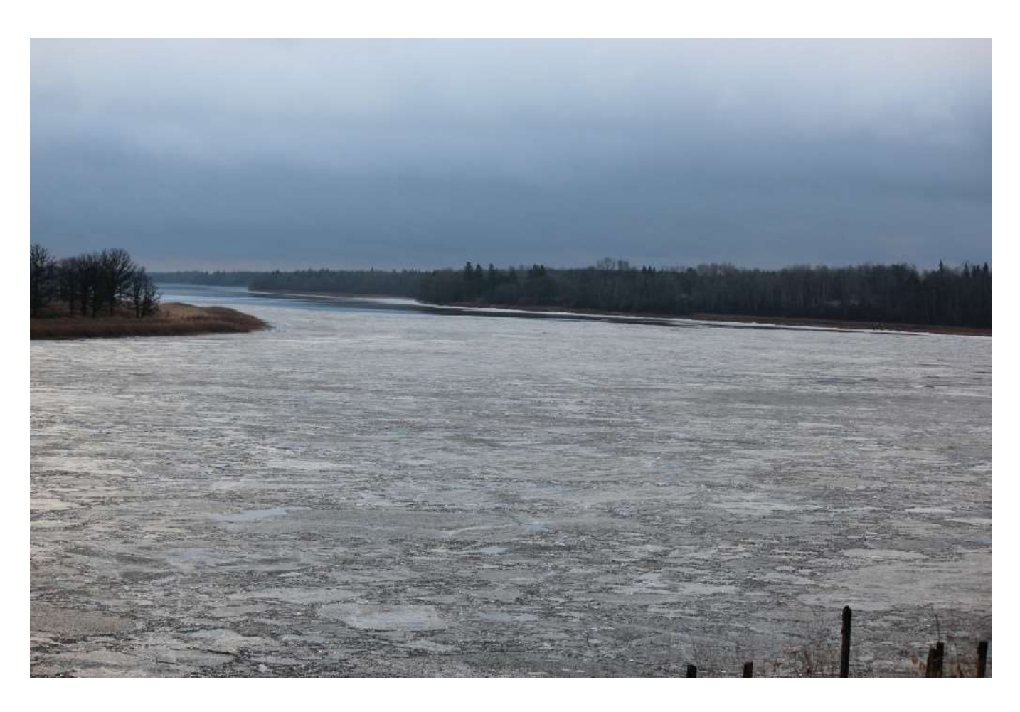
After a few hours this was our view and then before you knew it you couldn't see any ice when looking at the river both ways.