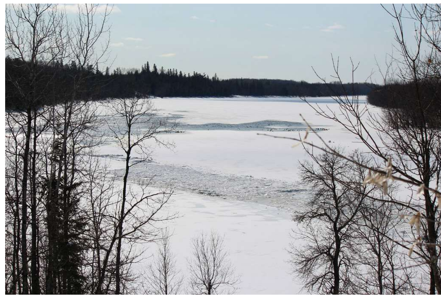
This is 8.7 miles from Birchdale Landing looking to the East: