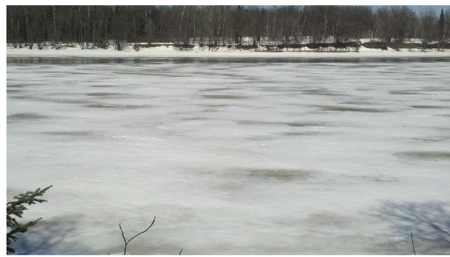
Here is 3 miles looking to the west and you can barely see there is open water: