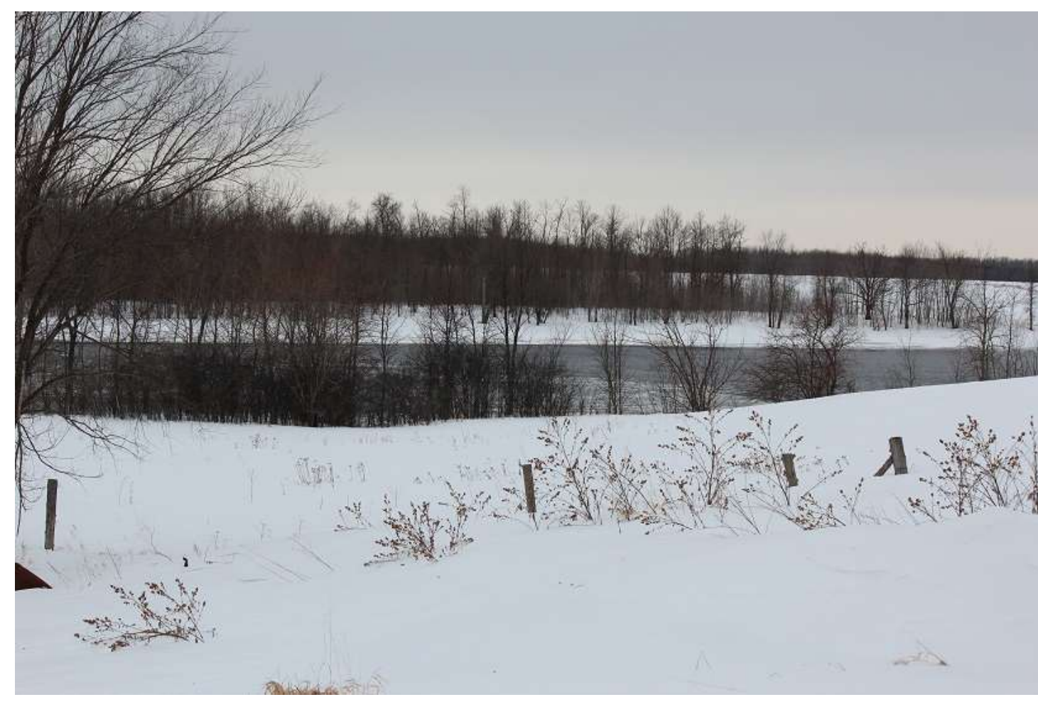
This picture is also 17.8 miles east of Birchdale Landing showing the end and where the ice is again: