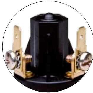
Illustration shows spade terminals included with all switches