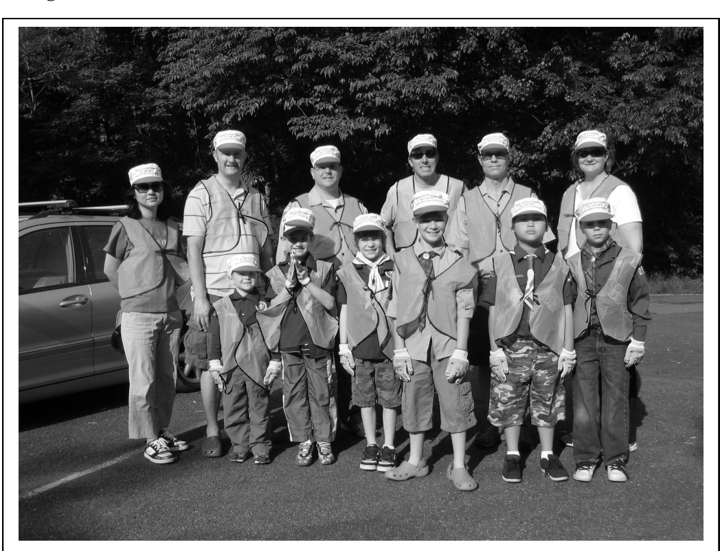
Scouts and leaders from Pack 1503 helped at the MVCA Community Clean-Up.