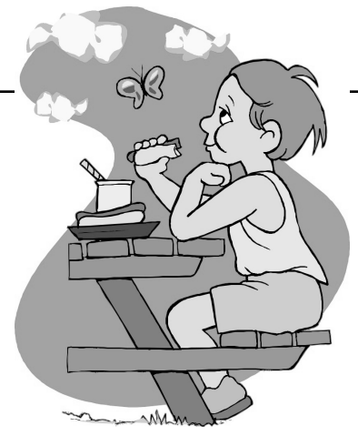
It's picnic time!