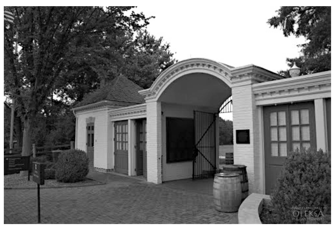
The Texas Gate at Mount Vernon Estate