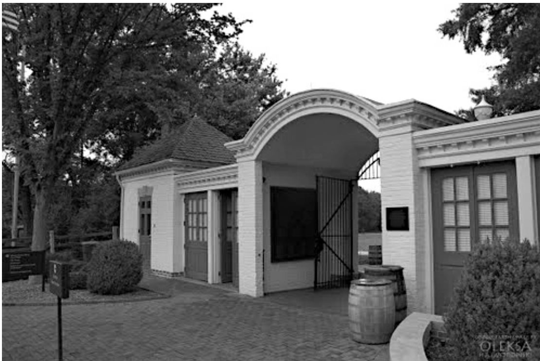
The Texas Gate at Mount Vernon Estate