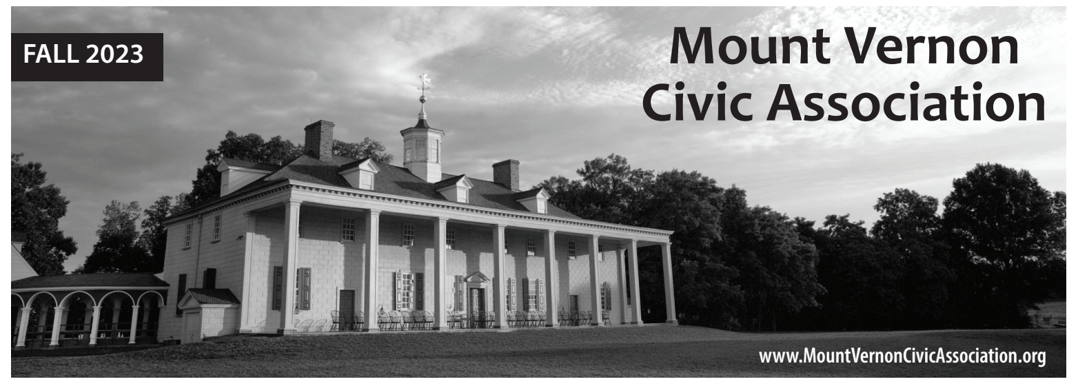
Belle Rive • Ferry Landing Estates • Ferry Landing Villa • Ferry Point Estates • Mount Vernon Forest Mount Vernon Grove • Mount Vernon Park • Oxford • Riverbend • Riverwood • Vernon Square • Washington Woods Westgate • Wycliffe on the Potomac • Yacht Haven Estates