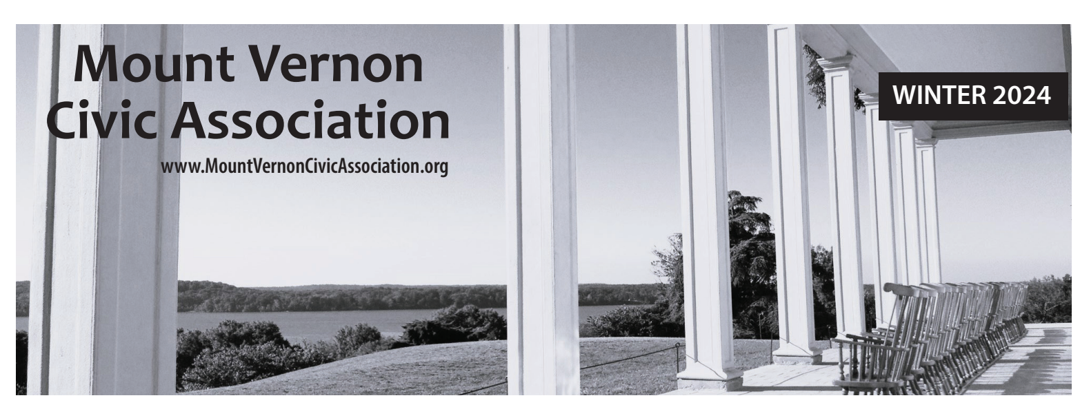
Belle Rive • Ferry Landing Estates • Ferry Landing Villa • Ferry Point Estates • Mount Vernon Forest Mount Vernon Grove • Mount Vernon Park • Oxford • Riverbend • Riverwood • Vernon Square • Washington Woods Westgate • Wycliffe on the Potomac • Yacht Haven Estates