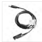
Programming cable (USB port)