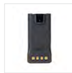
Li-polymer battery 2000mAh