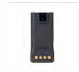
Li-polymer battery 3000mAh