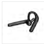
BT Wireless earpiece