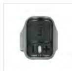
BT wireless ring PTT