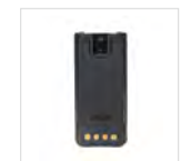
Li-polymer battery 3000mAh