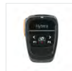
BT Wireless remote speaker microphone