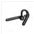
BT Wireless earpiece