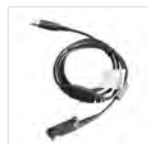
Programming cable (USB port)