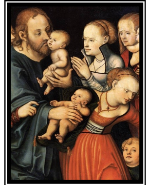
Christ Blessing the Children, Lucas Cranach the Elder, 1537

As we sing in today's Psalm, we joyously await the day when we will praise His name forever in the kingdom that lasts for all ages. This is the sabbath rest promised by Jesus—first anticipated by Moses (see Exodus 20:8–11 ), but which still awaits the people of God (see Hebrews 4:9 ).