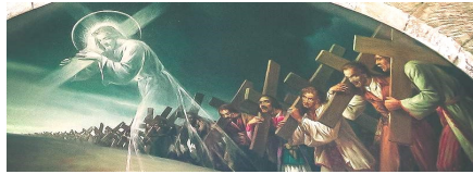
(Faith Catholic (Daily Universal Prayer & Commentary))

En la primera lectura, una mujer influyente que constantemente ofrece hospitalidad a Eliseo es recompensada con la promesa de un hijo. San Pablo recuerda a la comunidad romana que a través del bautismo comparten la muerte y resurrección de Cristo. En el Evangelio, Jesús les dice a sus apóstoles que quien no tome su cruz y me siga no es digno de mí.