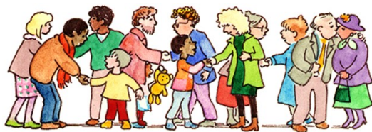
We All are the People of God! We are a Family