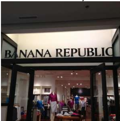
Banana Republic at Galleria 2584 E Sunrise Blvd Space J18 Fort Lauderdale, FL 33304