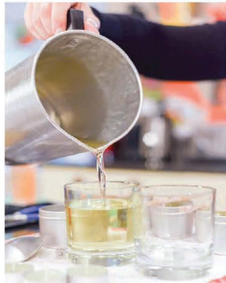
Make Your Own Candle Events