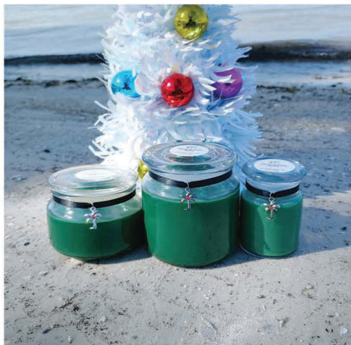
Hand Poured Soy Candles