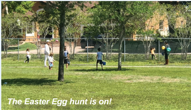
The Easter Egg hunt is on!