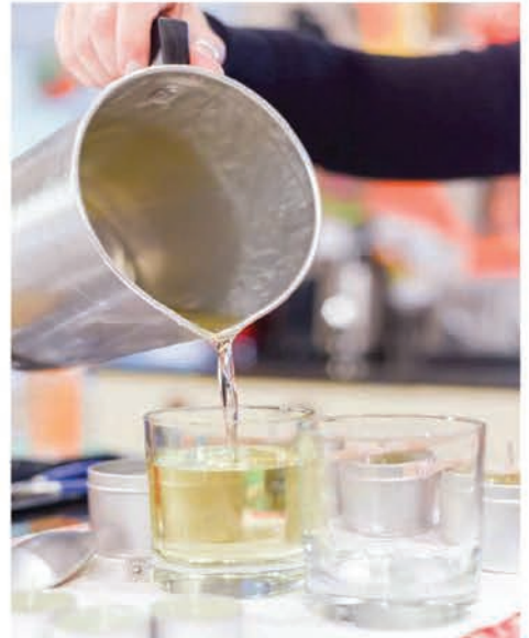
Make Your Own Candle Events