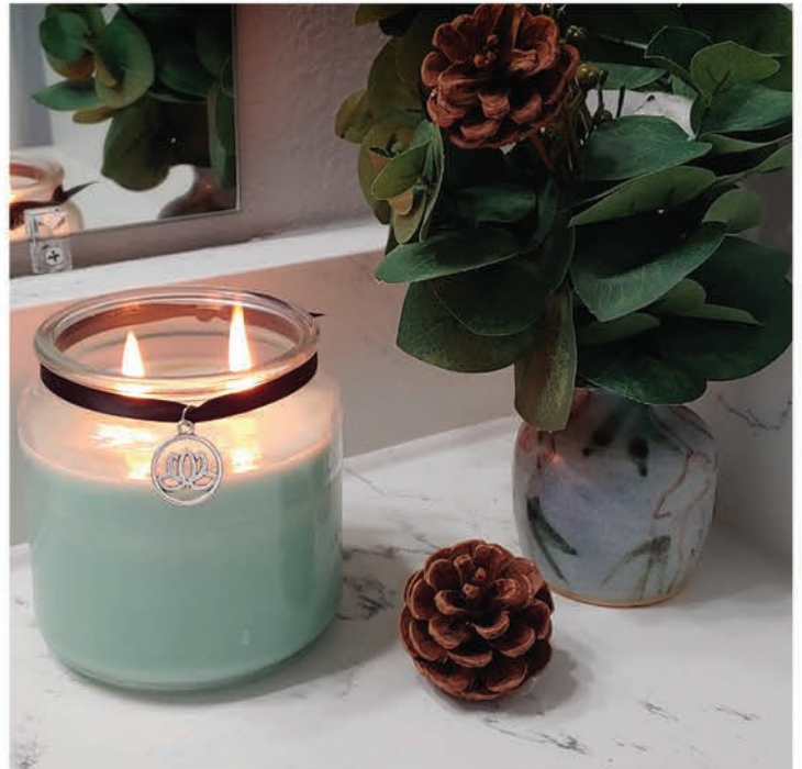
Hand Poured Soy Candles