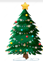
Annual Tree Lighting at Raymond F. Nine Park