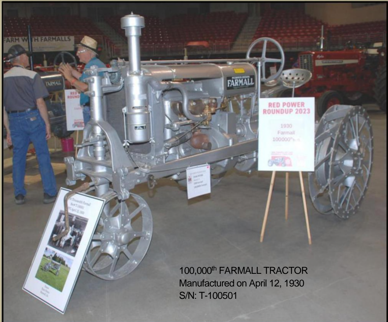
100,000 th FARMALL TRACTOR Manufactured on April 12, 1930 S/N: T-100501

My most enjoyable summer trip this year began on June 14 th to Nebraska. Fonner Park in Grand Island was our choice destination as that was the location of the 34 th Annual Red Power Round Up hosted by Nebraska Chapter 12. About one half of the Chapter 27 attending members chose the easy way of flying into Omaha and driving over to Grand Island. The other half chose to drive with their RVs and trailers taking in many places of interest along the way. Located in the center of the State, Grand Island is accessible to the traveling public from Interstate-80, US Highways 281, 30, and 34, and Nebraska Highway 2, as well as a small Regional Airport. Grand Island with a population of 55,000 covers approximately 30 square miles and has an elevation of 1800 feet. By comparison, Florida's Disney World covers 35 square miles.