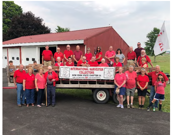
A group photo of everyone wearing red while

I am not the only one who thinks the 1206 tractors with their two-tone color combination is the best looking of all the International Harvester line. With the Macauley clan farming 4,000 acres, there was a lot to see as the view looking out over the valley below was awesome. Just passing by the enormous farm machinery and Steiger tractors was a show in itself. One was burned beyond recognition in a fire last year.