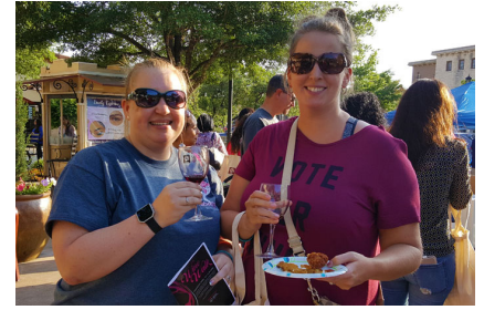
Drink For Pink Wine Walk