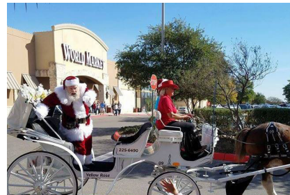
Santa's Arrival & Santa Saturdays

Easter Bunny: Join us for free photos with the Easter Bunny! Free crafts and entertainment will be provided for the children while they wait for the pictures. The first 100 children will receive an Easter egg with a special surprise to be claimed at one of our participating stores. Bring the whole family and make a day of it at Village at Stone Oak!