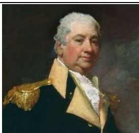
Henry Knox – namesake of Knoxville