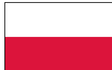
Flag of Poland