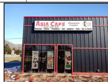
The event was held at Asia Café on Callahan Drive.