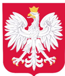
Poland Coat of Arms

Mark your calendars for the October 4 Farewell Dinner. You would be welcome to join us at the Greek Fest on Friday September 27, and the presentation by the Mayors on Thursday morning, October 3. Look for specifics in the next few weeks.