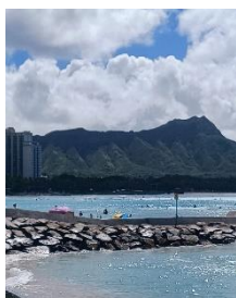
Diamond Head, Hawaii