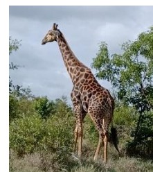
Giraffe on Safari