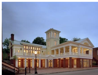
Intl. Storytelling Cntr, Jonesborough

June 11-17, 2023: As you read this, Ambassadors will be winding their way to Western Colorado to begin their journey. Check the Club's Group Facebook page (Friendship Force of Knoxville) for photos of this exciting trip!