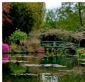
Monet's Garden, France

Dessert and light refreshments provided.