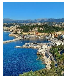
The Port at Nice