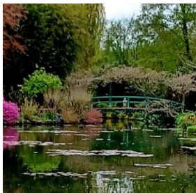
Monet's Garden, France

Dessert and light refreshments provided.