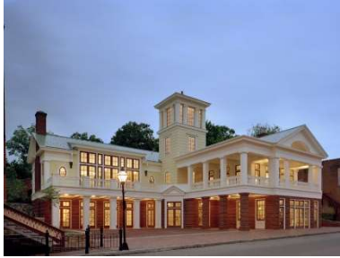
Intl. Storytelling Cntr, Jonesborough

June 11-17, 2023: As you read this, Ambassadors will be winding their way to Western Colorado to begin their journey. Check the Club's Group Facebook page (Friendship Force of Knoxville) for photos of this exciting trip!