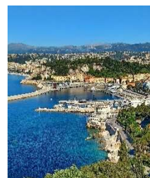
The Port at Nice