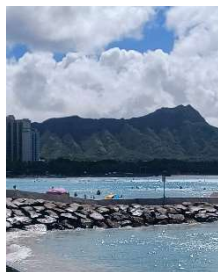
Diamond Head, Hawaii