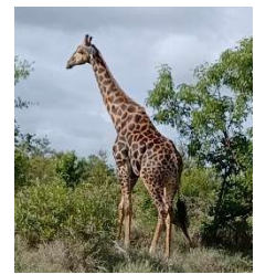
Giraffe on Safari