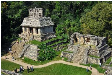
Mayan ruins of Palenque for more details.

This journey takes place November 1-8 (for 7 nights) and some of the activities include a tour by boat on Grijalva River, a one-night stay in hotel Casa Mexicana (breakfast included), in order to visit the towns of Chiapa de Corzo and San Cristobal (lunch in San Cristobal included) and so much more.