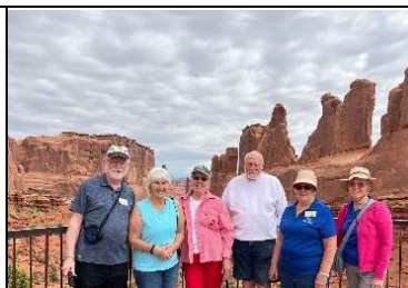
Arches Natl Park