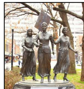
TN Woman Suffrage Memorial

Sep 16 is the free day for our ambassadors to choose what they would like to do. If you have suggestions and want to tag along, please let us know.