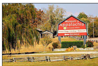
Museum of Appalachia

Sep 17 tour the Museum of Appalachia with lunch, then drive to Norris Dam and later the Lenoir Museum and Grist Mill. And if nothing else, please come to the Farewell Dinner at Cherokee Bluff Clubhouse. Bring a pot-luck dish, look at the views of Knoxville, and bid good-bye to our friends from Spokane. The more, the merrier!