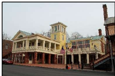
Jonesborough Storytelling Center

Sep 13 drive to Jonesborough for lunch from the Main Street Café and a performance at the International Storytelling Museum. If you have never been to Jonesborough, this is a good chance to see the oldest town in Tennessee. We would like to carpool with as many members as possible. If you want to go and could drive or if you want to go and need a ride, indicate such on the sign-up sheet.