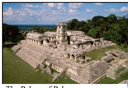
The Palace of Palenque