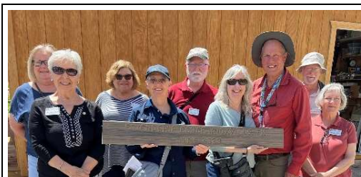
Museum of the West; FFWC honored FFK by having a plank for their boardwalk created with our club's name