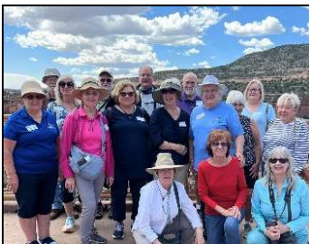
Colorado Natl Monument