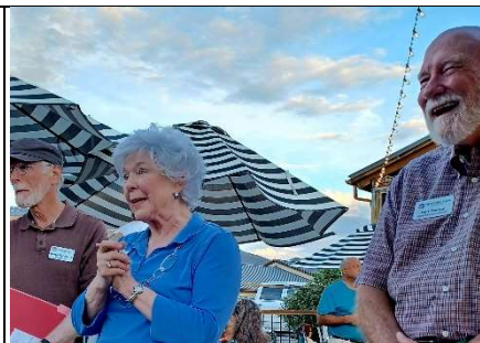
Farewell dinner at Varaison Vineyards & Winery which is a story all its own.