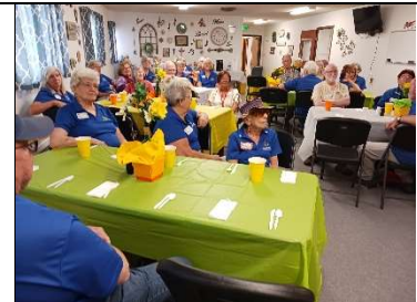
Welcome dinner of salad and dessert potluck