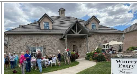
Wine tasting & charcuterie