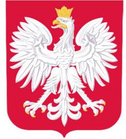
Poland's Coat of Arms

FFK is excited about our upcoming Open World program with Mayors from Poland. The Open World program is implemented by the Congressional Office for International Leadership (COIL), a U.S. legislative branch agency. Our delegates will arrive in Washington D.C. on Wednesday September 25. On Friday, September 27, the delegation will fly into Knoxville and Friendship Force Knoxville will host them until they begin their journey back to Poland on Saturday, October 5. We are expecting five or six mayors, as well as a facilitator and interpreter. We will know their names and cities in late July or early August.