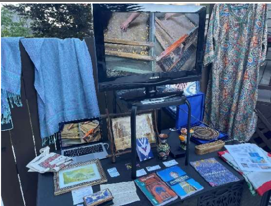
Art & Marsha's souvenirs from Uzbekistan'