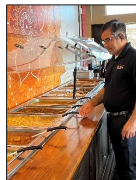
Buffet at The Aroma Cafe