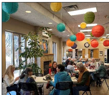
Sixteen FFK Members attended the BYO Brown Bag lunch & presentation