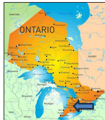
Where we're going! See close-up below.