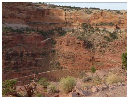
Shafer Canyon Trail