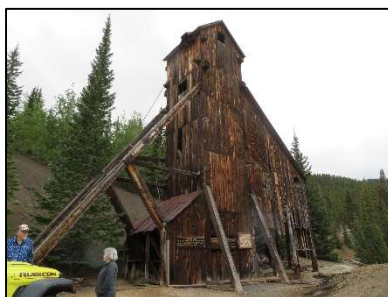
Yankee Girl abandoned mine.