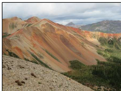
Red Mountain #1 or #2 on the Corkscrew Canyon Trail